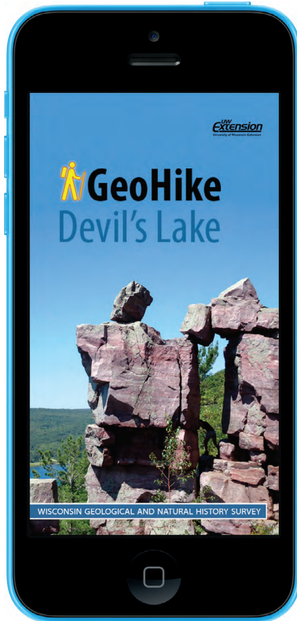
Designed for iPhone and iPad Requires iOS 6.0 or later