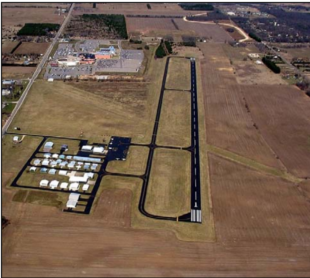
Baraboo-Wisconsin Dells Airport

As an important part of our statewide transportation network, local airports such as Baraboo-Wisconsin Dells Airport play a critical role in fostering business growth and economic development.