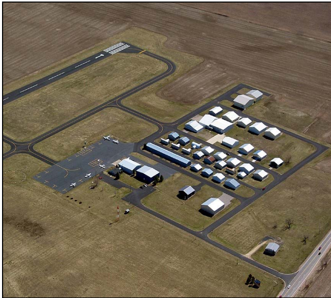
Terminal and hangar area