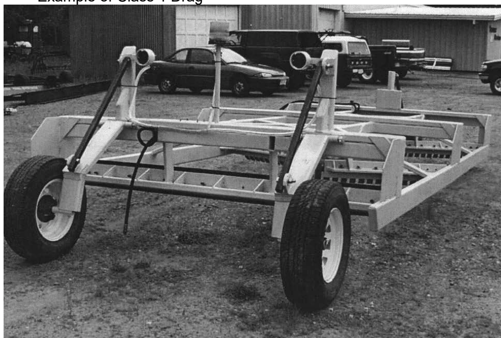
Example of Class 1 Drag