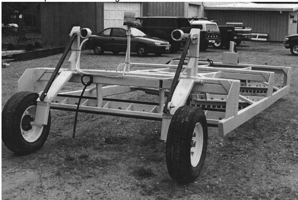
Example of Class 1 Drag