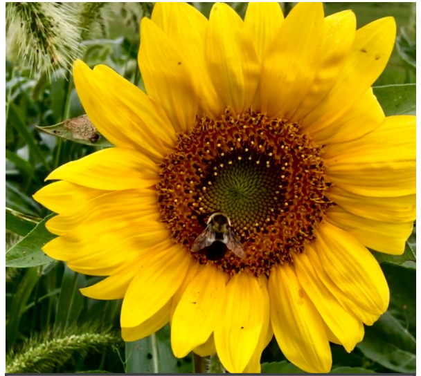
Bumble Bee on a sunflower in a cover crop field.

Pollinators, such as birds, bats, bees, butterflies, and beetles are responsible for pollinating flowers in our backyard along with a number of fruits, vegetables, and nut crops. They are a critical part of our food system and are esthetically pleasing to view. Unfortunately, pollinator populations are in decline due to a number of reasons including loss of habitat, misuse of chemicals, disease, and climate change.