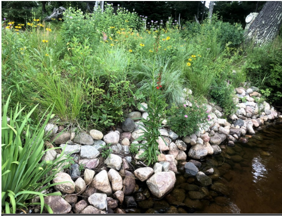
Vegetated Rock Riprap along shoreline of lake.

The configurations of our lake shorelines in Wisconsin have been constantly changing over the last few thousand years. Soil erosion is a natural process that is part of that configuration. Unfortunately, when the rate of erosion speeds up due to loss of vegetation, physical disturbances, changes in water levels, or increases in wave action, the increased soil loss and removal of native vegetation is bad for the health of the lake. Soil eroding into the lake can reduce water quality, and increase the growth of algal blooms and aquatic plants. Eroding soil also has a damaging effect on fish and wildlife habitat. The negative effects of shoreline erosion are a concern for landowners who care about the health of their lake and their property.