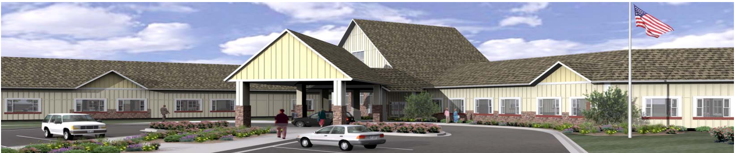
ARCHITECT RENDERING OF NEW SAUK COUNTY HEALTH CARE CENTER