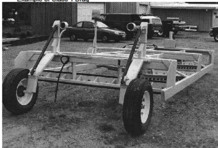
Example of Class 1 Drag